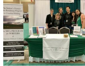
San Antonio 2020