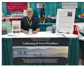
Los Angeles 2016